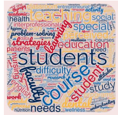
This word cloud was created from the presentation abstracts. The frequency of words corresponds with font size.